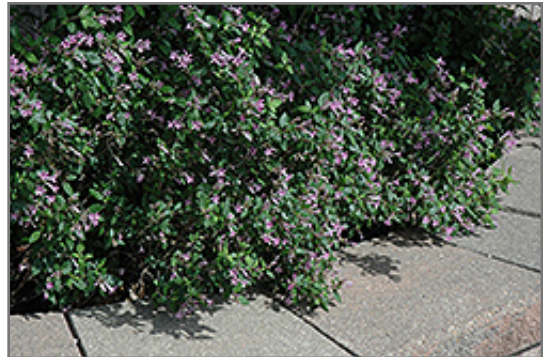
Leptodermis in bloom

This shrub does best in full sun to partial shade. It prefers to grow in average to moist conditions, and shouldn't be allowed to dry out. It is not particular as to soil type or pH. It is somewhat tolerant of urban pollution. This species is not originally from North America.