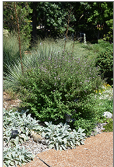
Leptodermis in bloom