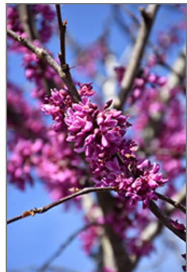
Eastern Redbud (tree form) flowers