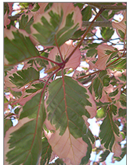
Tricolor Beech foliage