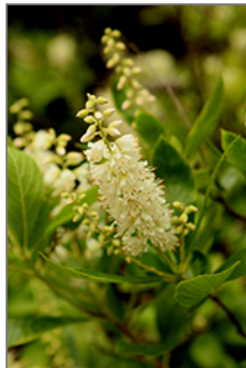
Summersweet flowers