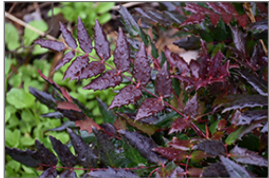
Oregon Grape Holly foliage

This shrub does best in partial shade to shade. It does best in average to evenly moist conditions, but will not tolerate standing water. It is not particular as to soil pH, but grows best in rich soils. It is somewhat tolerant of urban pollution, and will benefit from being planted in a relatively sheltered location. Consider applying a thick mulch around the root zone in winter to protect it in exposed locations or colder microclimates. This species is native to parts of North America.