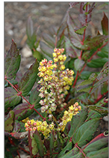
Oregon Grape Holly flowers

Oregon Grape Holly is a multi-stemmed evergreen shrub with a ground-hugging habit of growth. Its average texture blends into the landscape, but can be balanced by one or two finer or coarser trees or shrubs for an effective composition.