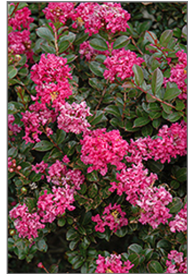
Pocomoke Crapemyrtle flowers

This is a relatively low maintenance shrub. Trim off the flower heads after they fade and die to encourage more blooms late into the season. Deer don't particularly care for this plant and will usually leave it alone in favor of tastier treats. It has no significant negative characteristics.