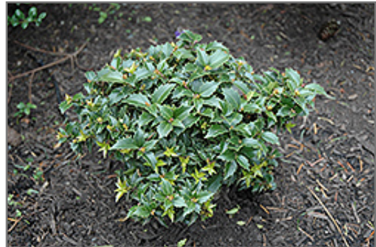
Rock Garden Holly Photo courtesy of NetPS Plant Finder

Rock Garden Holly is recommended for the following landscape applications;