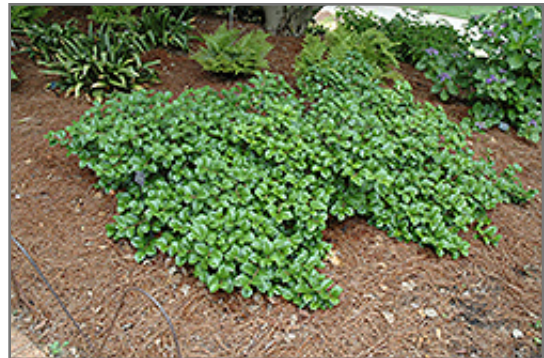
Maryland Dwarf American Holly