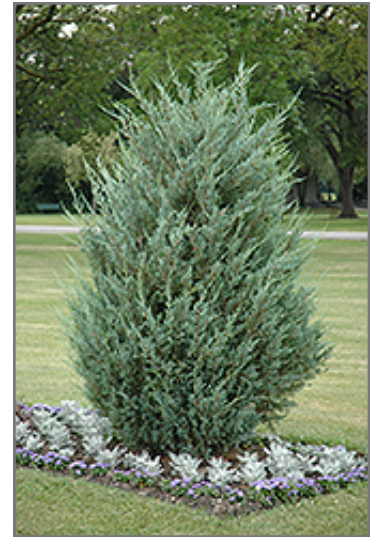
Moonglow Juniper

Moonglow Juniper is recommended for the following landscape applications;