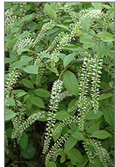
Henry's Garnet Virginia Sweetspire flowers