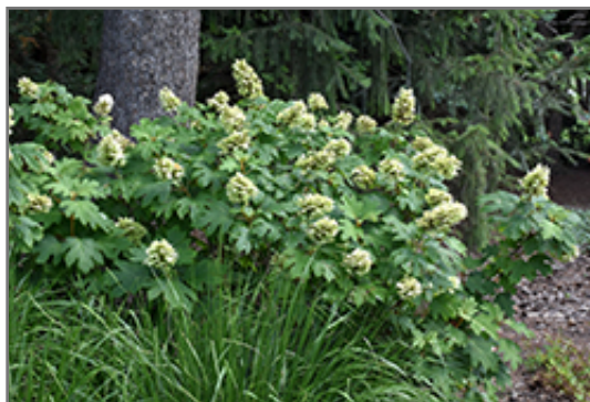
Alice Hydrangea in bloom