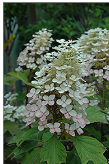
Alice Hydrangea flowers

This is a relatively low maintenance shrub, and is best pruned in late winter once the threat of extreme cold has passed. It has no significant negative characteristics.