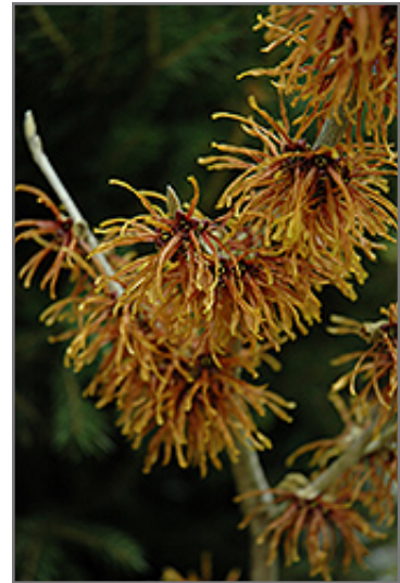
Jelena Witchhazel flowers