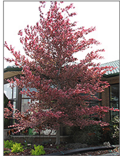
Tricolor Beech