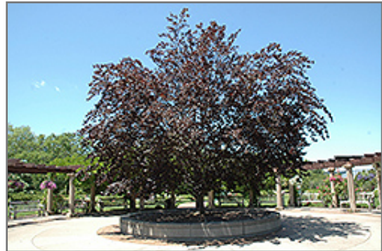
Purple Beech

Purple Beech is recommended for the following landscape applications;