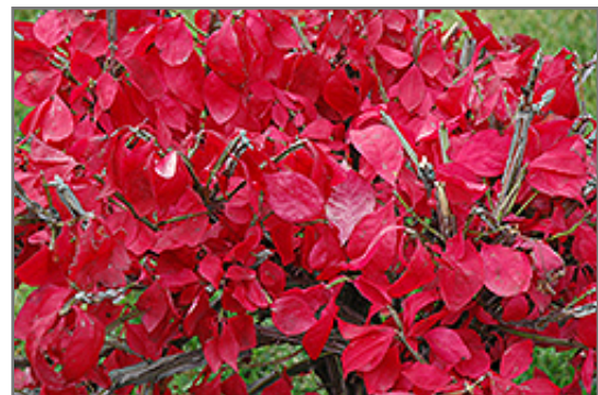
Compact Winged Burning Bush in fall