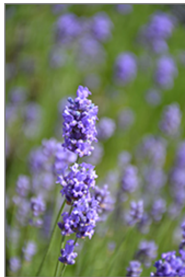
Hidcote Blue Lavender flowers