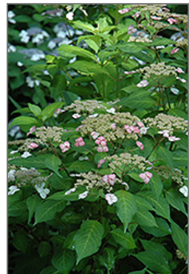
Golden Sunlight Hydrangea flowers