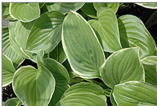
Frozen Margarita Hosta foliage