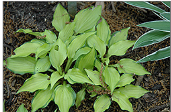
Cracker Crumbs Hosta

Cracker Crumbs Hosta is recommended for the following landscape applications;