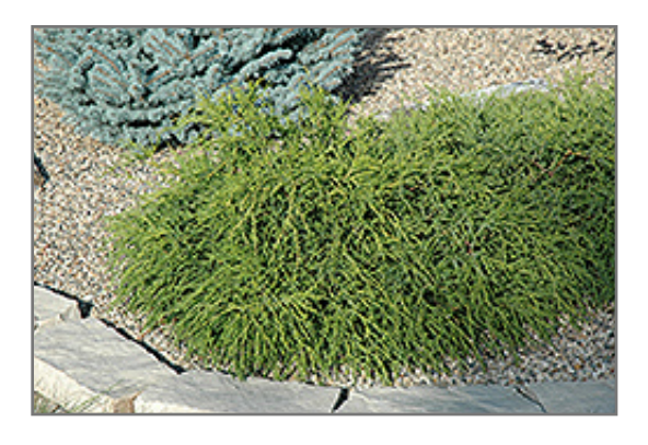
Mops Falsecypress