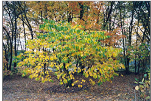
Northern Strain Redbud in fall

Northern Strain Redbud will grow to be about 25 feet tall at maturity, with a spread of 30 feet. It has a low canopy with a typical clearance of 3 feet from the ground, and is suitable for planting under power lines. It grows at a medium rate, and under ideal conditions can be expected to live for 60 years or more.