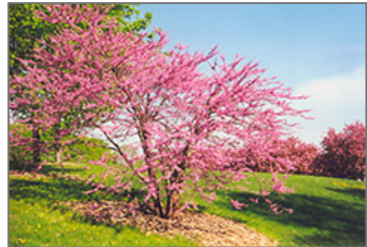
Northern Strain Redbud in bloom