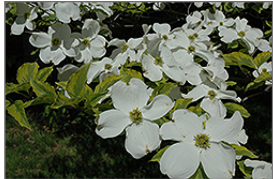
Rainbow Flowering Dogwood flowers

Rainbow Flowering Dogwood is a multi-stemmed deciduous tree with a stunning habit of growth which features almost oriental horizontally-tiered branches. Its average texture blends into the landscape, but can be balanced by one or two finer or coarser trees or shrubs for an effective composition.