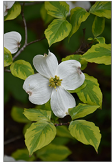
Rainbow Flowering Dogwood flowers

* This is a 'special order' plant - contact store for details