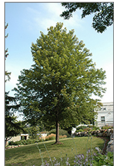
Celebration Maple