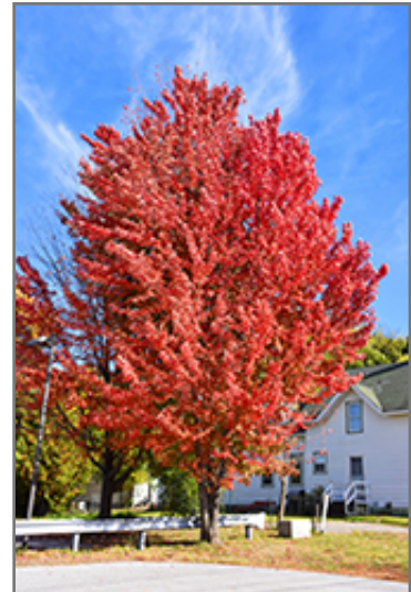
Celebration Maple in fall