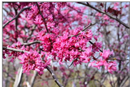
Appalachian Red Redbud flowers