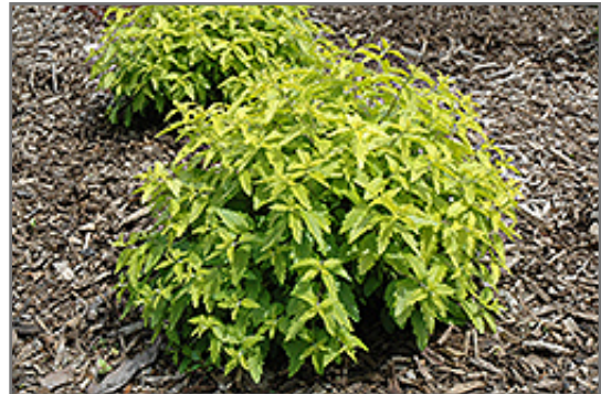
Sunshine Blue Caryopteris

Sunshine Blue Caryopteris is recommended for the following landscape applications;