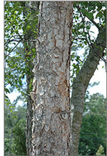
Dura Heat River Birch bark