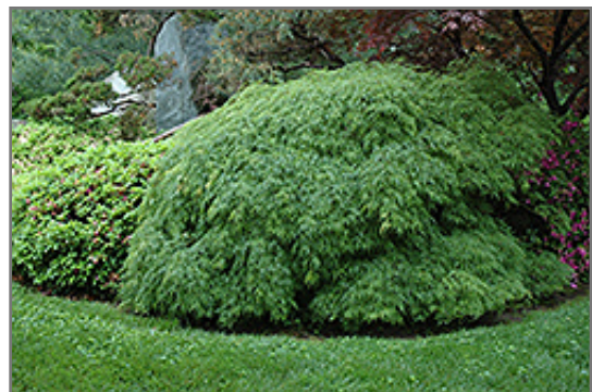
Cutleaf Japanese Maple