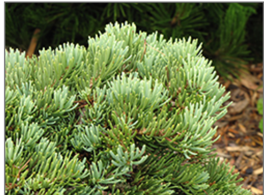
Masonic Broom White Fir foliage