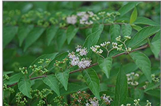
Issai Beautyberry flowers

Issai Beautyberry makes a fine choice for the outdoor landscape, but it is also well-suited for use in outdoor pots and containers. Because of its height, it is often used as a 'thriller' in the 'spiller-thriller-filler' container combination; plant it near the center of the pot, surrounded by smaller plants and those that spill over the edges. It is even sizeable enough that it can be grown alone in a suitable container. Note that when grown in a container, it may not perform exactly as indicated on the tag - this is to be expected. Also note that when growing plants in outdoor containers and baskets, they may require more frequent waterings than they would in the yard or garden.