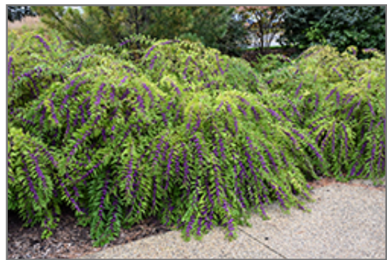
Issai Beautyberry fruit