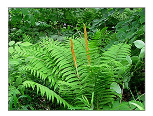
Cinnamon Fern in bloom