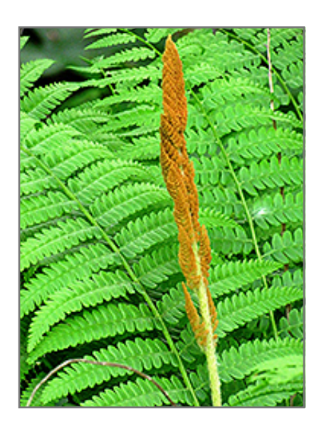
Cinnamon Fern flowers