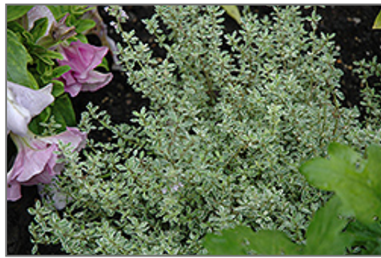
Silver Lemon Thyme foliage