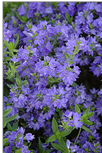
Trehane Creeping Speedwell flowers

This is a relatively low maintenance plant, and should only be pruned after flowering to avoid removing any of the current season's flowers. It is a good choice for attracting butterflies to your yard, but is not particularly attractive to deer who tend to leave it alone in favor of tastier treats. It has no significant negative characteristics.