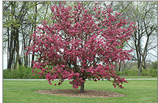
Purple Prince Flowering Crab in bloom

Purple Prince Flowering Crab is a dense deciduous tree with an upright spreading habit of growth. Its average texture blends into the landscape, but can be balanced by one or two finer or coarser trees or shrubs for an effective composition.