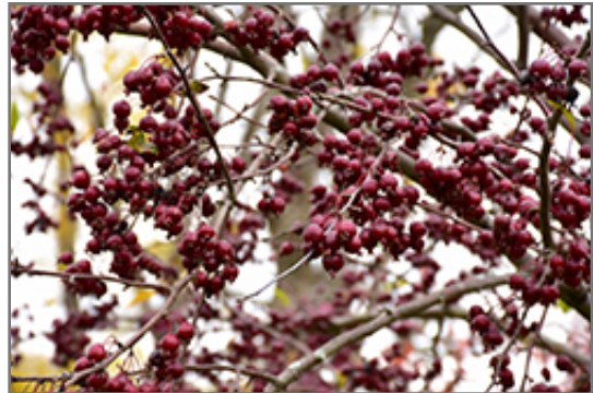
Purple Prince Flowering Crab fruit

This tree should only be grown in full sunlight. It prefers to grow in average to moist conditions, and shouldn't be allowed to dry out. It is not particular as to soil type or pH. It is highly tolerant of urban pollution and will even thrive in inner city environments. This particular variety is an interspecific hybrid.