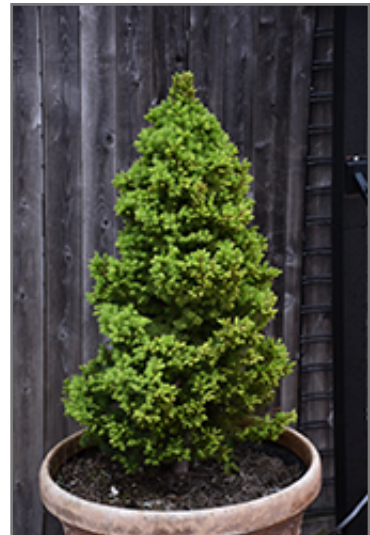
Rainbow's End Spruce