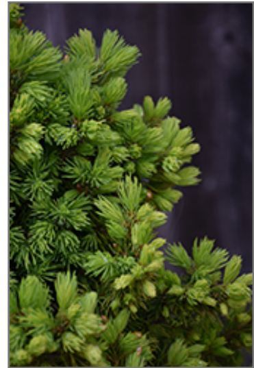
Rainbow's End Spruce foliage

This shrub should only be grown in full sunlight. It prefers to grow in average to moist conditions, and shouldn't be allowed to dry out. It is not particular as to soil type or pH. It is somewhat tolerant of urban pollution, and will benefit from being planted in a relatively sheltered location. This is a selection of a native North American species.