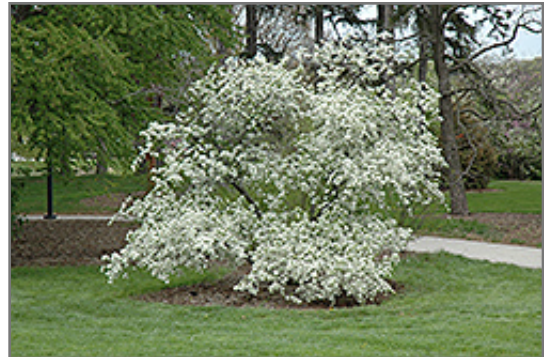
Fauriei Pear in bloom