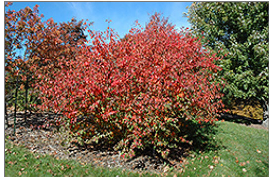
Korean Sun Pear in fall