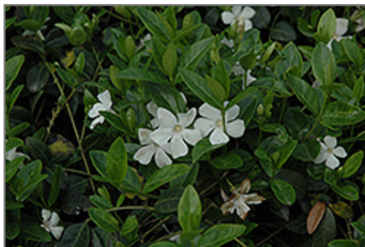
White Periwinkle flowers