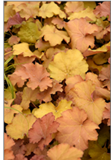
Caramel Coral Bells foliage

This is a relatively low maintenance plant, and should be cut back in late fall in preparation for winter. It is a good choice for attracting hummingbirds to your yard. It has no significant negative characteristics.