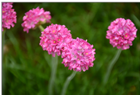
Bloodstone Sea Thrift flowers

Bloodstone Sea Thrift will grow to be only 6 inches tall at maturity extending to 10 inches tall with the flowers, with a spread of 18 inches. Its foliage tends to remain low and dense right to the ground. It grows at a slow rate, and under ideal conditions can be expected to live for approximately 10 years. As an evergreen perennial, this plant will typically keep its form and foliage year-round.