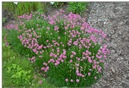
Bloodstone Sea Thrift in bloom