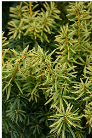
Dwarf Bright Gold Yew foliage