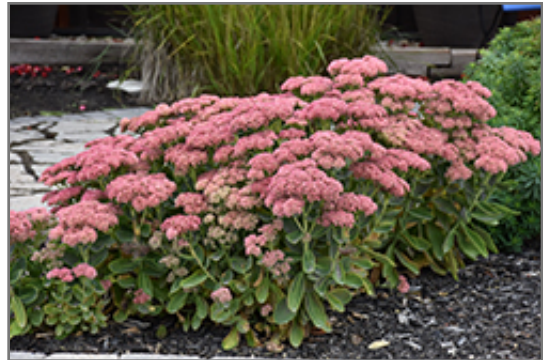
Autumn Fire Stonecrop in bloom

This is a relatively low maintenance plant, and is best cleaned up in early spring before it resumes active growth for the season. It is a good choice for attracting bees and butterflies to your yard, but is not particularly attractive to deer who tend to leave it alone in favor of tastier treats. It has no significant negative characteristics.