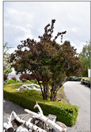
Black Beauty Elder