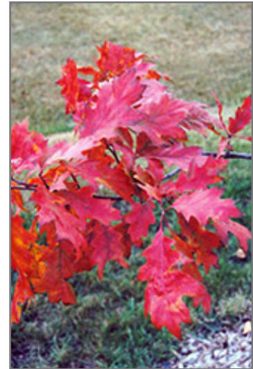
Red Oak in fall

This tree should only be grown in full sunlight. It prefers to grow in average to moist conditions, and shouldn't be allowed to dry out. It is not particular as to soil type, but has a definite preference for acidic soils, and is subject to chlorosis (yellowing) of the leaves in alkaline soils. It is highly tolerant of urban pollution and will even thrive in inner city environments. This species is native to parts of North America.