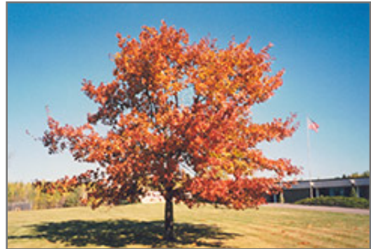
Red Oak in fall