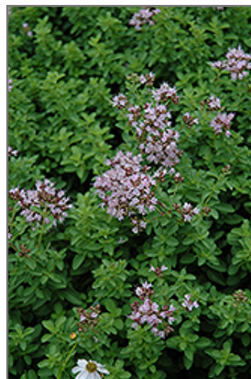
Dwarf Oregano flowers

Aside from its primary use as an edible, Dwarf Oregano is suitable for the following landscape applications;