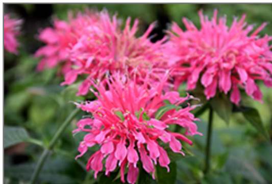
Coral Reef Beebalm flowers