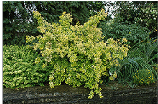
Gold Leaf Forsythia

Gold Leaf Forsythia is recommended for the following landscape applications;