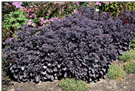
Rock 'N Grow Back in Black Stonecrop in bloom

Rock 'N Grow Back in Black Stonecrop has masses of beautiful clusters of creamy white star-shaped flowers with cherry red eyes at the ends of the stems from late summer to early fall, which emerge from distinctive crimson flower buds, and which are most effective when planted in groupings. The flowers are excellent for cutting. Its attractive large succulent round leaves emerge burgundy in spring, turning black in color with showy dark gray variegation and tinges of coppery-bronze throughout the season. The deep purple stems are very colorful and add to the overall interest of the plant.