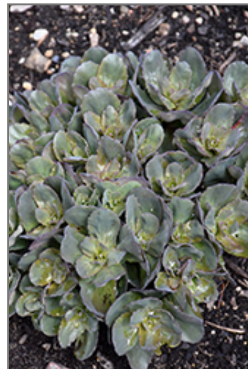
Rock 'N Grow Back in Black Stonecrop foliage