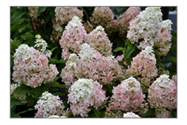
Quick Fire Fab Hydrangea flowers

This shrub will require occasional maintenance and upkeep, and is best pruned in late winter once the threat of extreme cold has passed. It has no significant negative characteristics.