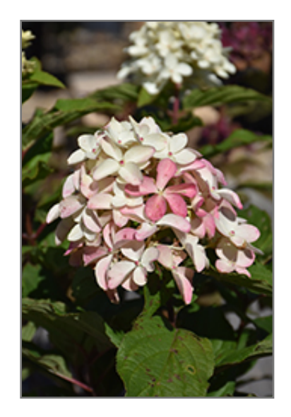
Quick Fire Fab Hydrangea flowers

Quick Fire Fab Hydrangea is recommended for the following landscape applications;