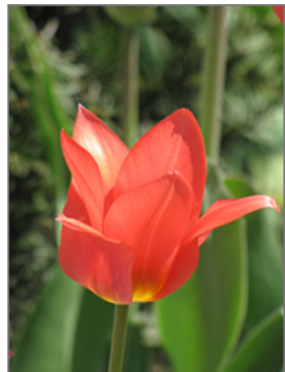
Red Emperor Tulip flowers