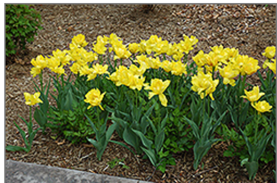
Monte Carlo Tulip in bloom